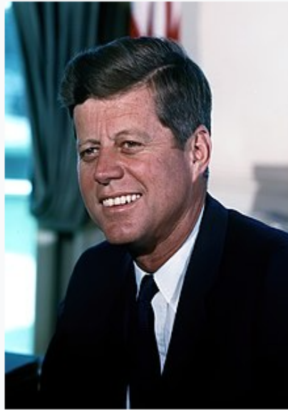
John F. Kennedy